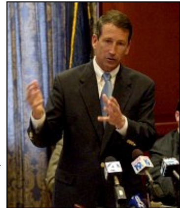
Just desserts: South Carolina Gov. Mark Sanford's (pictured above while unveiling his 2004-05 budget) involvement in wooing Reliable included inviting the company's top executives for dinner at the Governor's Mansion.

The Pickens County site pick means that all of Reliable's manufacturing and product development positions and part of its distribution network will relocate from Mt. Vernon and Elmsford, N.Y. Founded in New York City in 1920, the company's organizational core has been based in Mt. Vernon since 1937.