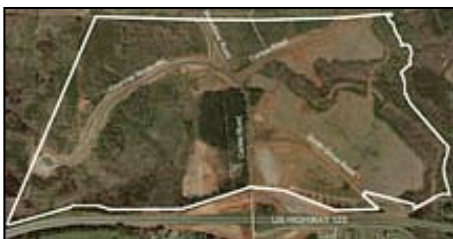
Park pioneer: Reliable's 300,000-sq.-ft. (27,000-sq.-m.) facility in Pickens County Commerce Park (shown in an aerial view) will be the first building inside the 310-acre (124-hectare) development.

Reliable's current Mt. Vernon headquarters is also relocating, but not very far. It's remaining in southern New York, moving only 12 miles (19 kilometers) north, into office space that the company already occupies in Elmsford.